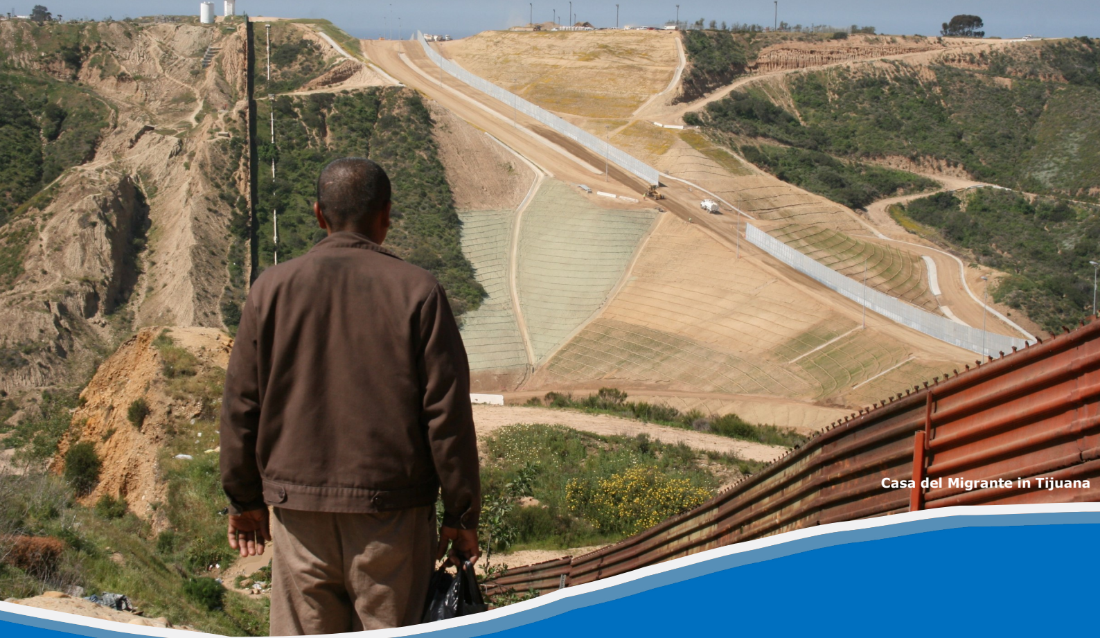
Casa del Migrante in Tijuana